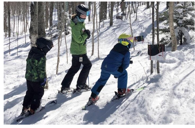
120+ kids plus accompanying instructors and parents