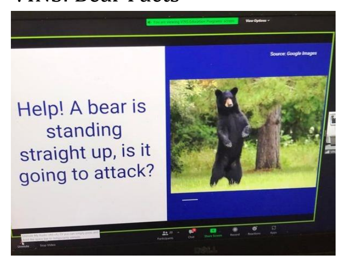
70 attended in-person and virtually